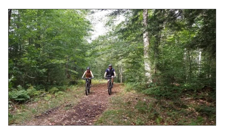
Maple Ridge Trail