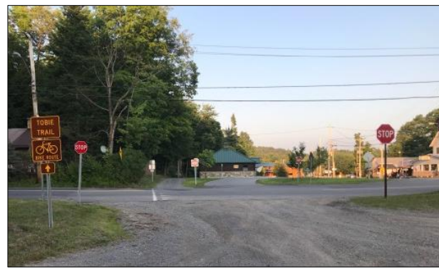
Eagle Bay Welcome Center

14. Moose River from Rondaxe bridge to North Branch bridge - Easy, pleasant, four-hours one-way paddle. Curvy, downstream and lots of nice beachy areas for picnics, stretching and sunning. For more information on this trail click on the link and search for "Paddling the Moose River": <a href="http://adirondackbasecamp.blogspot.com/">http://adirondackbasecamp.blogspot.com/</a> For this trip, two cars are needed or help from one of our local canoe and kayak outfitters to get you to your starting point. For local outfitters, please scroll down.